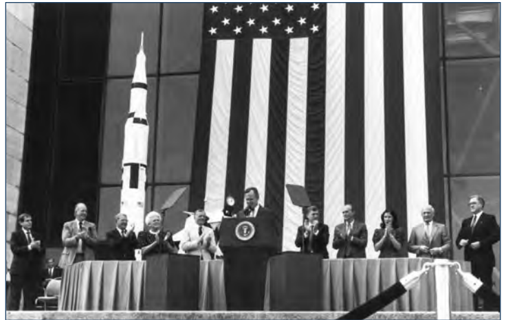
President George H. W. Bush announces his Space Exploration Initiative plan on 20 July 1989, the 20th anniversary of the Apollo 11 lunar landing.