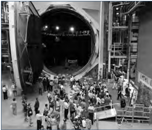
JSC open house, 2005. Overall view of visitors listening to Heather Paul and Amy Ross at the spacesuits exhibit in Building 32, with Chamber A's 40-foot door open in the background. (Image Number jsc2005e16878)

Since it was constructed in 1965, the SESL has tested all Apollo command and service modules, Apollo lunar modules, space suits for extra-vehicular activity, the Skylab/Apollo telescope mount system, various Space Shuttle systems, the Apollo/Soyuz docking module, many assembled-in-orbit components of the International Space Station, and various large scale scientific satellite systems such as the parabolic reflector subsystem of the Applications Technology Satellite. The thermal vacuum testing done at the SESL since 1965 has been a significant factor contributing to the success of both the manned and unmanned space program of the United States.